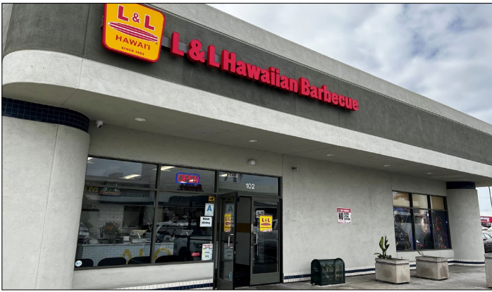
L&L Hawaiian Barbecue restaurant is now open at 510 Oceanside Blvd. in the Seaside Crossroads center.