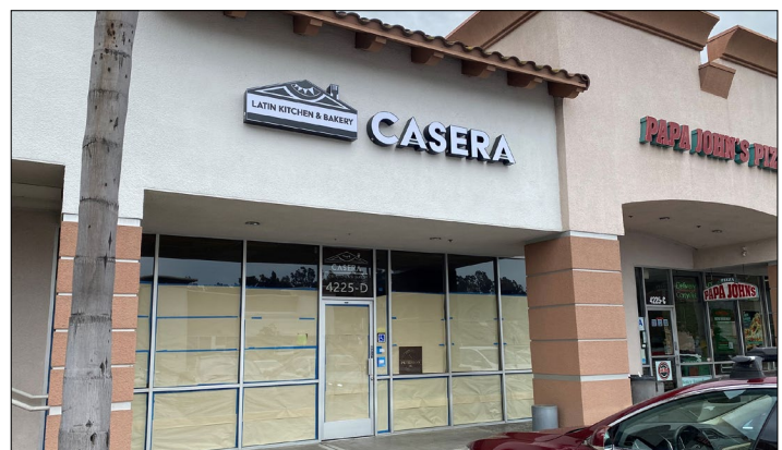
Casera Latin Kitchen & Bakery opening soon at 4225 Oceanside Blvd., Ste D.