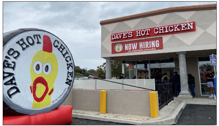
Dave's Hot Chicken is now open at 4201 Oceanside Blvd. Suite B in the Rancho del Oro Gateway shopping center.