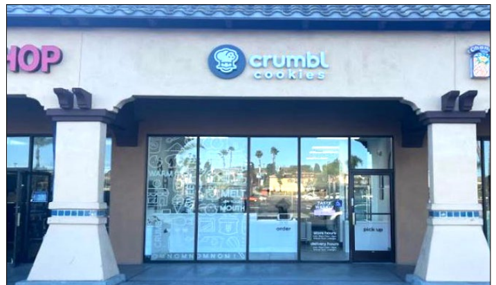
Crumbl Cookies recently opened at 459 College Blvd. in the Mission Marketplace shopping center.