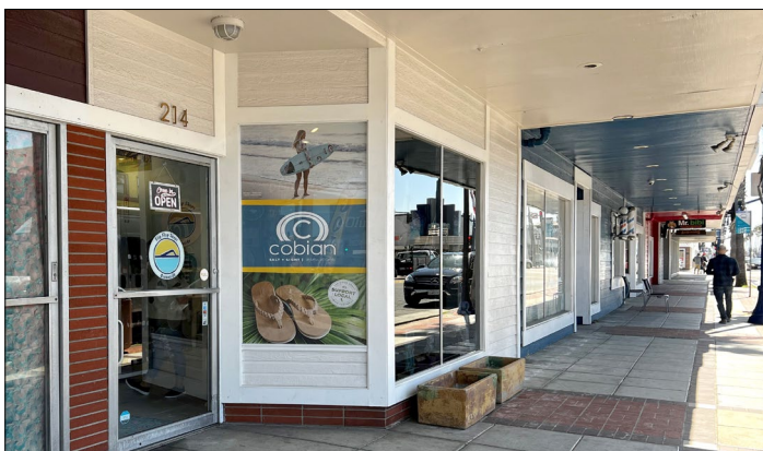
Flip Flop Shops Oceanside opened at 214 N. Coast Hwy. in Downtown Oceanside, selling beach, surf, and relaxation footwear.