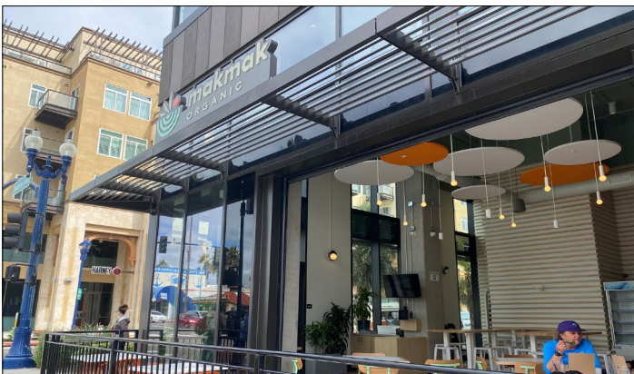
Makmak Organic opened at 121 N. Cleveland St. in the Pierside South building in Downtown Oceanside and serves healthy organic South East Asian-inspired street fare.