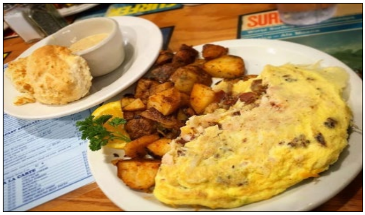
Beach Break is located at 1802 South Coast Hwy. in South Oceanside.

While dining, you can check out the colorful surfboards, the surfboard-inspired ceiling fans, and surf photos that decorate this breakfast-and-lunch-only spot. The weekend wait can be long, but the Dwelleys set up an honor-system coffee station.