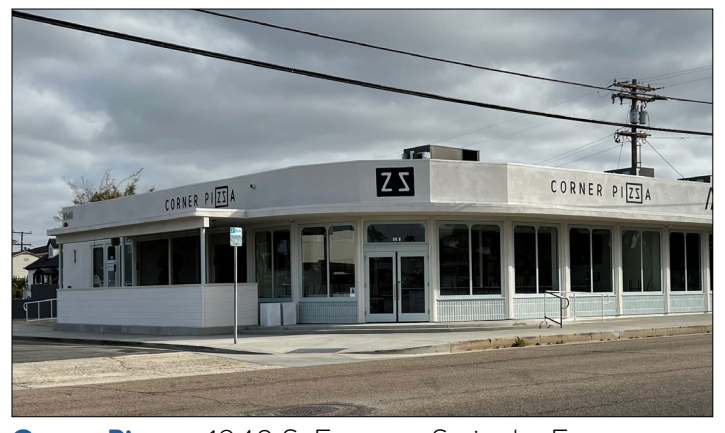
Corner Pizza at 1940 S. Freeman St. in the Freeman Collective, serving Brooklyn-inspired pizzas, beer and wine.