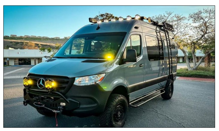
<u>Outpost Vans</u> is a full-service custom van builder and campervan rental company.