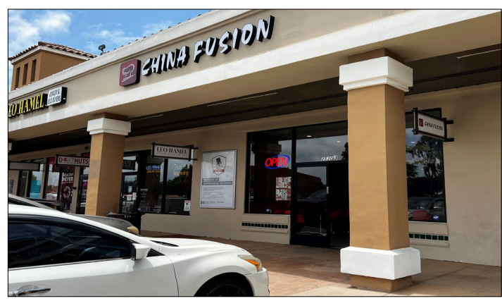
<u>China Fusion</u> recently opened a second restaurant at 2530 Vista Way, Ste J, in the Fire Mountain shopping center, serving fresh Chinese cuisine.