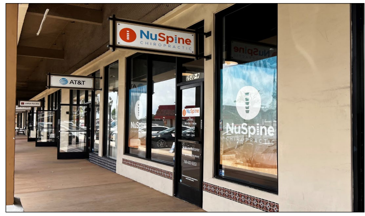
In the Fire Mountain shopping center, <u>Nu Spine</u> <u>Chiropractic Oceanside</u> at 2530 Vista Way, Ste P provides affordable, convenient, quality chiropractic care.