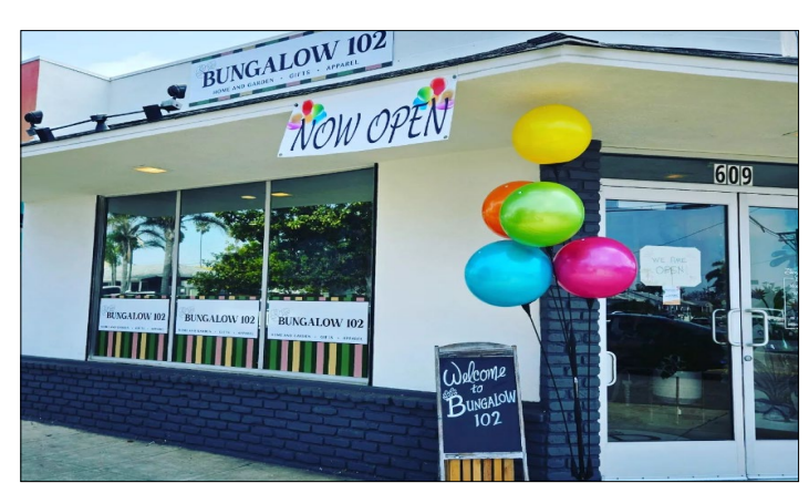
Bungalow 102 reopened at 609 Vista Way in South Oceanside. Bungalow 102 offers a curated selection of vintage and lifestyle goods.