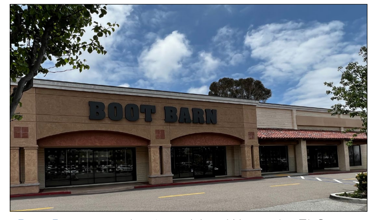
Boot Barn opened at 2555 Vista Way in the El Camino North shopping center, offering a wide selection of cowboy boots, work boots, western wear, workwear, and outdoor gear.