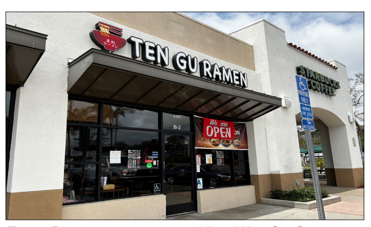
<u>Tengu Ramen</u> is open at 2183 Vista Way, Ste B2, in the Pacific Coast Plaza, serving ramen, appetizers, and more.