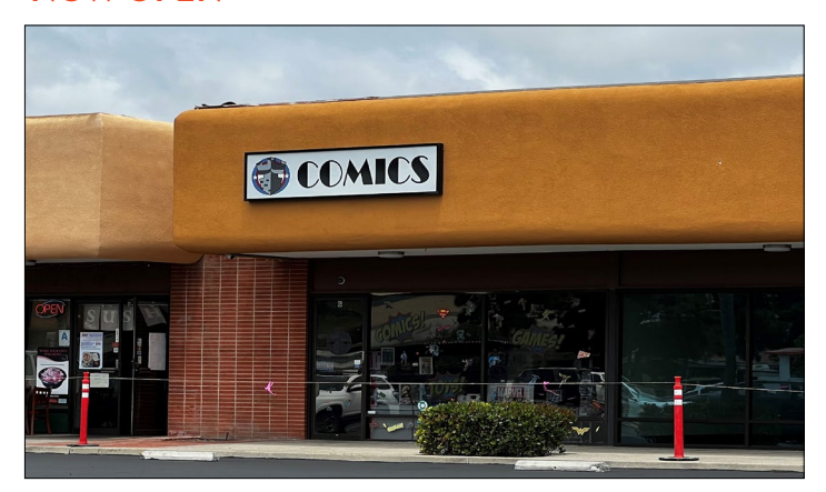
The Comics Stronghold recently opened at 1906 Oceanside Blvd., Unit G in the Oceanside Village Square center, offering comics and collectables.