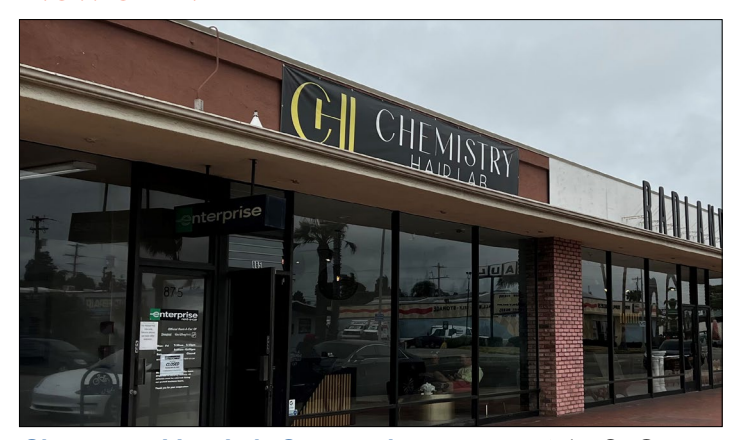
<u>Chemistry Hair Lab Oceanside</u> is open at 865 S. Coast Hwy., offering a range of styling services and products.