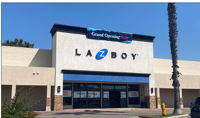
La-Z-Boy Furnishings & Decor at 2445 Vista Way in the El Camino North shopping center.