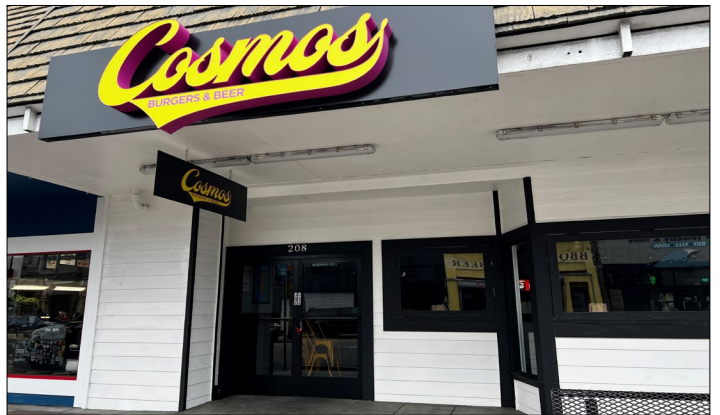
Cosmos Burgers at 208 N. Coast Hwy. in downtown Oceanside.