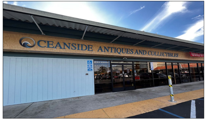
Oceanside Antiques & Collectible at 1810 Oceanside Blvd. in the Frazier Farms Market Center. This 8,391 sq. ft. facility houses over 55 vendors offering a wide range of collectibles and antiques.