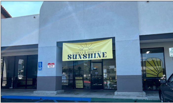
Sunshine Market & Refillery at 3529 Cannon Rd. in the Palm Tree Plaza shopping center. Offering a mix of dried goods fresh produce and grocery staples.