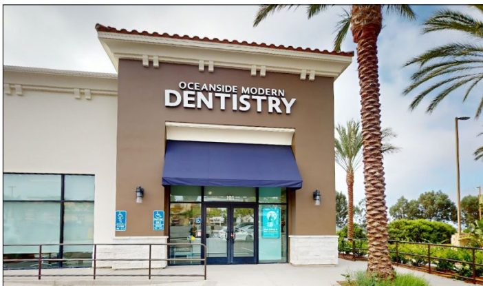
Oceanside Modern Dentistry at 2158 Vista Way, Ste 101 in the Pacific Coast Plaza.