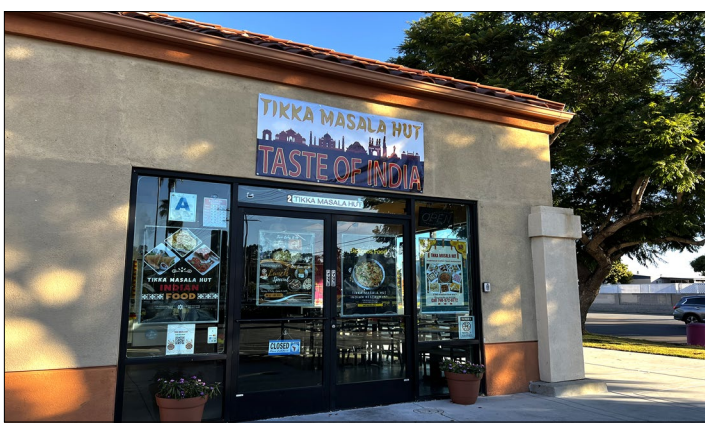
Tikka Masala Hut at 3780 Mission Ave., Ste 2 in the Marketplace del Rio shopping center, serving traditional Indian food.