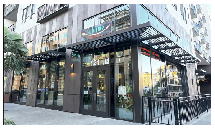
Sublime Tap House at 121 N. Cleveland St. in the Pierside South in Downtown Oceanside, serving gourmet comfort food.