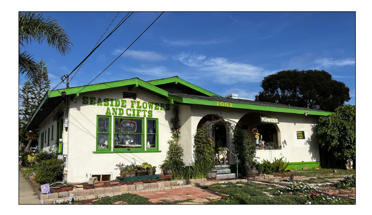
Seaside Flowers & Gifts, a family-owned and operated local florist, is celebrating its 30th year in business in Oceanside. Happy 30th Anniversary!