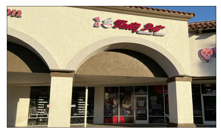
Tasty Pot at 1058 Mission Ave. in the Mission Square shopping center, serving authenic Taiwanese hotpot soups.