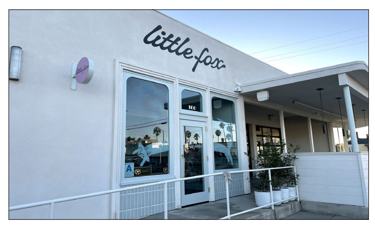
Little Fox Cups & Cones is a boutique ice cream shop in the Freeman Collective at 1940 S Freeman St., Ste 100.