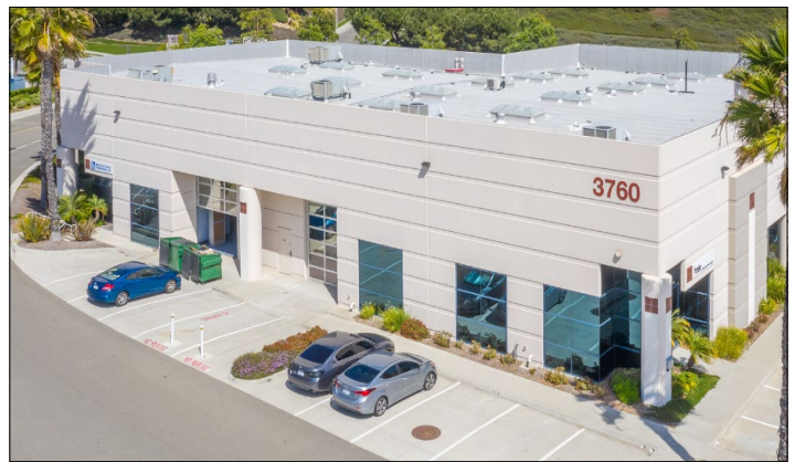
Mamma Ramona's Pizzeria at 3760 Oceanic Way , serving traditional pizza, calzones and salads.