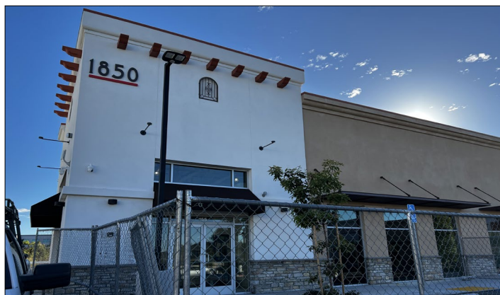
Taco's Don Paco serves Mexican cuisine and will soon open at 1850 Rancho del Oro Rd. in the Arroyo Verde center.