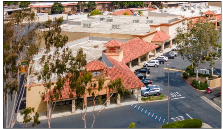
85 C Bakery Cafe at 3762-3774 Mission Ave. in the Marketplace del Rio shopping center, serving gourmet pastries and drinks.