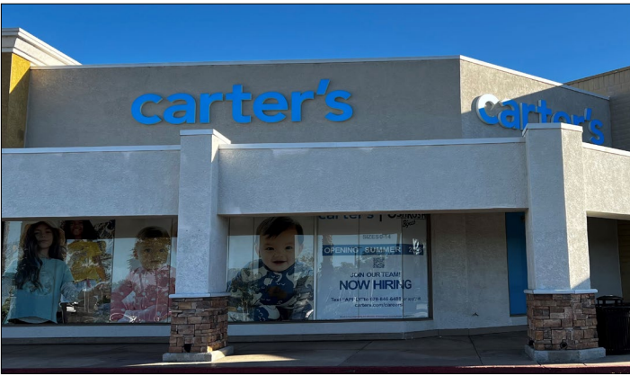
Carter's sells baby, toddler, and kids' clothing at 2435 Vista Way, Ste 23 , in the El Camino North shopping center.