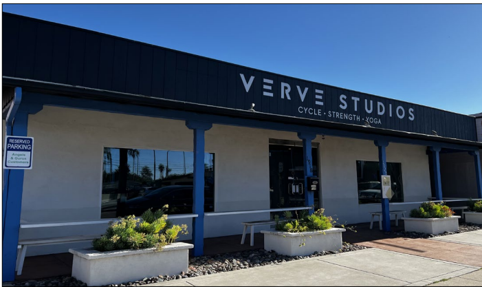
Verve Studio , an indoor cycling and yoga studio, is relocating to 1920 S Coast Hwy. in South Oceanside.